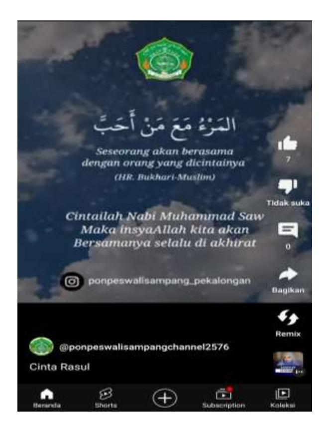
Picture 4. Youtube account Al-Masyhad Manbaul Falah Walisampang Pekalongan Boardingschool

The YouTube account of Al-Masyhad Manbaul Falah Islamic Boarding School, Walisampang, Pekalongan City, has 426 subscribers and 38 videos that have been uploaded to their channel. Youtube is a source of knowledge that is easily accessible and accessible to anyone. So it is appropriate as a da'wah to spread Islamic values.